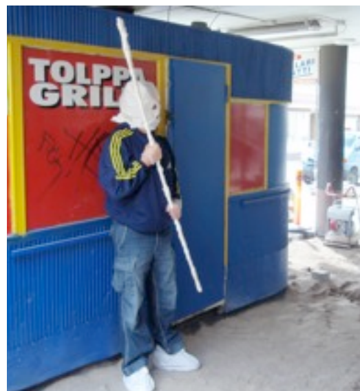
Is there civilisation to be found at Tolppa Grill?