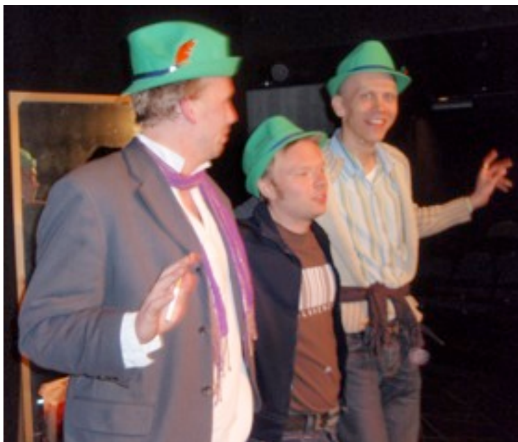
Green hats definitely are a token of a superior civilisation. Putting them on backwards seems questionable, though.

Each participant wrote down his/her civilisation question on a sheet of paper and then presented it with his/her civilisation object. Then all question sheets with the objects connected to them were laid on the floor and each participant wrote his/her name to the paper he/she found most interesting. The five questions that got most "votes" were chosen. The participants chose