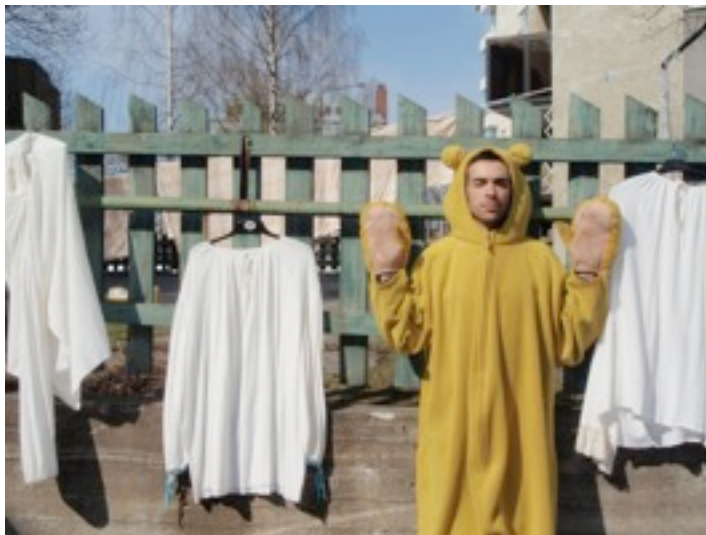
Bye bye Lappenranta. Hello Helsinki!