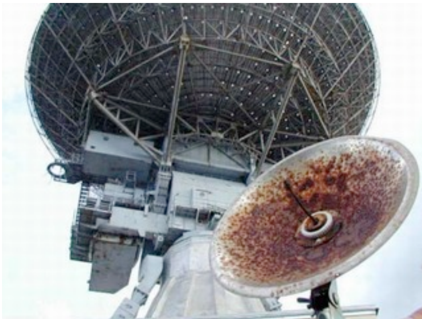
Karosta. The Saterllite station.

Today Karosta is an area of abandoned Soviet style block houses, high rate of unemployment, beautiful beaches and the booming city of Liepaja only 5 km away. This situation attracted artists to set up the movement of cultural and social development. The culture and information center called K@2 is the core of this. Their aims are to develop culture, education, information and interconnection centre in Karosta to achieve social changes in the local neighborhood and beyond; to offer open spaces for creative activities.