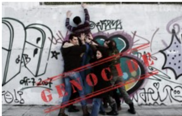
Entropia cast rehearsing Genocide.

Our intention is neither historic retrospection, nor schematic moralizations, but the exploration of the inexorable quests about the nature of human being itself, which in spite its "civilization", continues with illogical and inhuman practices, that unfortunately we all witnessed even recently. Our effort will be to pose the right questions and to attempt to understand this "unpleasant" reality. Because, as remarks American writer and activist, Susan Sontag, in the preface of the book referring to the killers' confessions, "The issue, finally, is not judgment. It is understanding. To make the effort to understand what happened in Rwanda is a painful task that we have no right to shirk – it is part of being a moral adult."